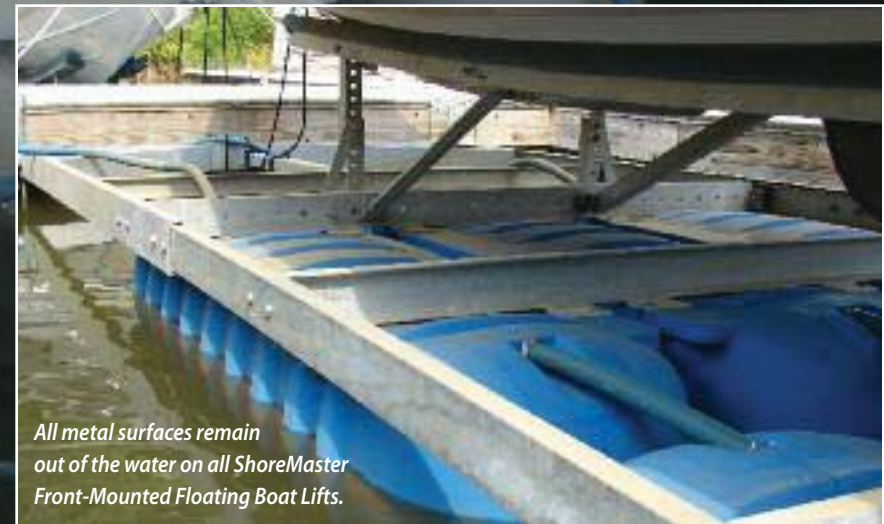
All metal surfaces remain out of the water on all ShoreMaster Front-Mounted Floating Boat Lifts.