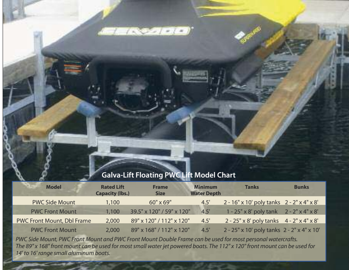
Galva-Lift Floating PWC Lift Model Chart