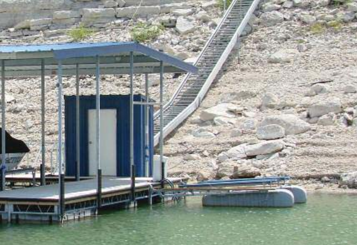
ShoreMaster Floating PWC Lift Model Chart